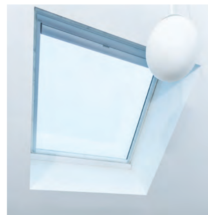
VELUX KEEPS 80% OF THE HEAT AND 99% OF THE UV RAYS OUTSIDE.

"The solar powered blinds are another feature of our VELUX skylights that we really appreciate. We were never able to find any blinds that fitted and worked properly for our old skylights. Our guests were more or less forced out of bed at sunrise. The VELUX blackout blinds keep the sun out and the wireless remote control works a treat."