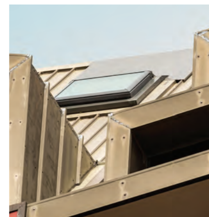
THE VELUX SKYLIGHTS LOOK GOOD FROM THE OUTSIDE AS WELL.