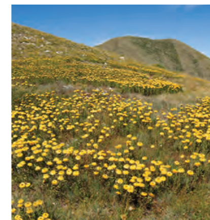
MOUNT HOTHAM IS A BEAUTIFUL PLACE, REGARDLESS OF THE SEASON.