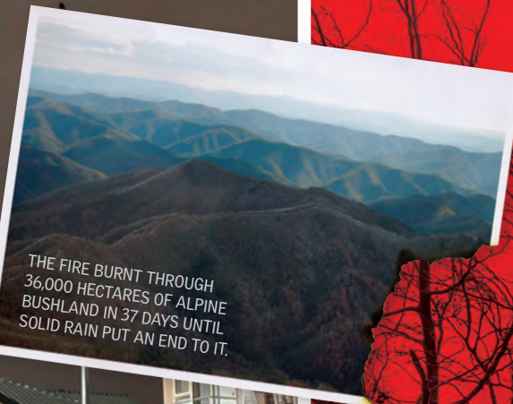
THE FIRE BURNT THROUGH 36,000 HECTARES OF ALPINE BUSHLAND IN 37 DAYS UNTIL SOLID RAIN PUT AN END TO IT.