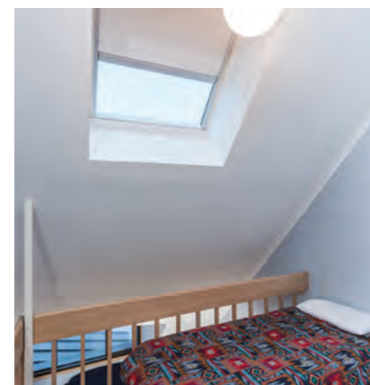
GUESTS APPRECIATE THE SOLAR POWERED BLOCKOUT BLINDS.