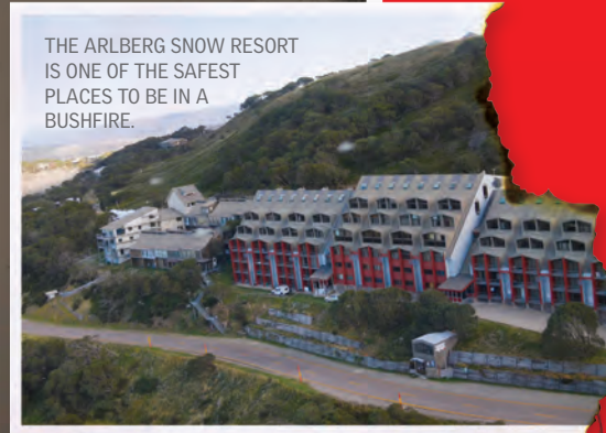
THE ARLBERG SNOW RESORT IS ONE OF THE SAFEST PLACES TO BE IN A BUSHFIRE.

It's all brick and much of it is subterranean...a bit like a bunker. In previous bushfires firefighters have actually used Arlberg as accommodation. They are welcome to stay for as long as they want. They do a fantastic job and we are more than happy to support them any way we can."